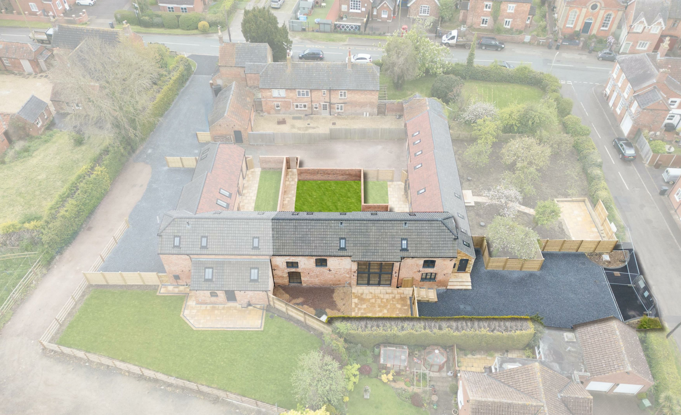
The Granary, Post Office Lane Redmile NG13 0GG